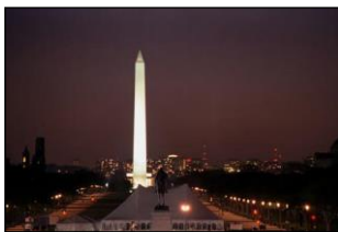
Figure 7. Video Frame

Artificial Neural Network's data hiding method is used to embed information in different audio (table 5) and video file (table 4) and we have calculated their respective PSNR which indicates at the better stego quality image.