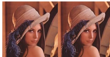
Figure 3. Original image Figure 4. Stego image

In our simulation we had tried to hide text contained inside different size and format of the image file like BMP, JPEG and GIF. PSNR of the file are calculated which is shown by table 2.