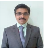
Prof, E&TC, Dr. D. Y .Patil School of Engineering & Technology, Lohegaon, Pune-412105, India.