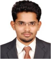
Student, E&TC, Dr. D. Y .Patil School of Engineering & Technology, Lohegaon, Pune-412105, India.