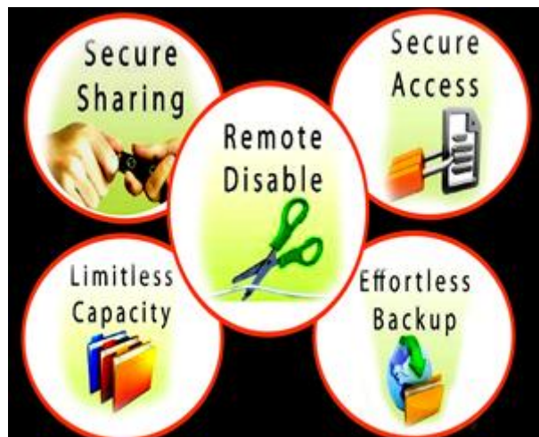
Figure 2. iTwin Features

When the device is disconnected from the main computer, you have to separate the two parts of the USB ports, which are separated in two separate USB devices. The two separate devices are very dense at less than two inches. Small size makes it convenient and easy to carry with you all the time. When you connect the second half to your laptop while travelling on the road, it will routinely install itself without any user interference. In addition, you can set up a special password that disables the device if you are going to lose it. This ensures you can lock down your files to avoid access by an illegal user.