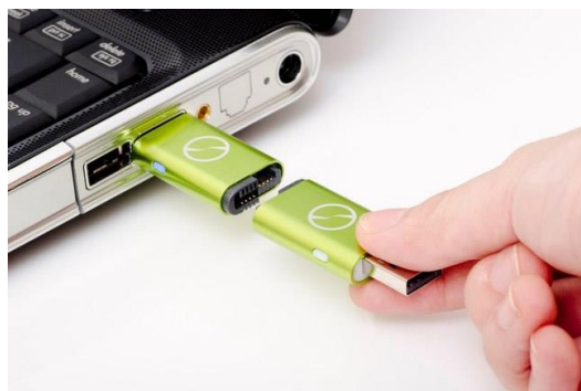
Figure 3. Splitting iTwin

One of the best features of iTwin device is the ability to securely access your data by establishing a personal Virtual Private Network which is capable of managing several tasks. You can able to access all your files and data on your home or office PC by using Windows Explorer. Otherwise you can access definite files that are stored in desktop applications. As well as it is possible to access files from your isolated computer and save that files to the device that you are currently using, till both the devices are enabled with iTwin Connect device.