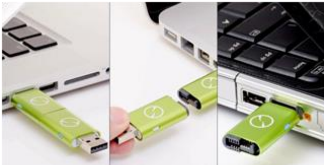
Figure 5. Example of iTwin

In the one half of the iTwin is lost; connection between the two halves of the device can be disconnected using the Remote Disable Feature. This is done by entering a unique disable code in the iTwin Disable Web Centre. The connection between the two halves of iTwin will be disabled within 90 seconds and after that, it is impossible to gain access to your data via the lost device even if somebody finds it.