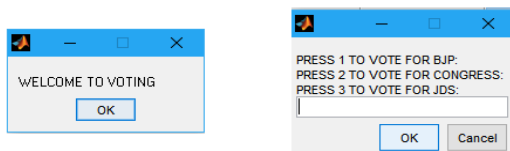
Figure 4.2 Voting Session Figure 4.2 says that the voting session has started and voter can choose the desired party.