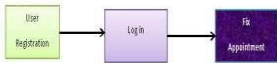
Figure 1. Registration and Appointment