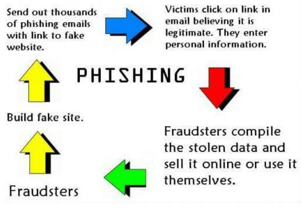
Figure 4. Mechanics of phishing