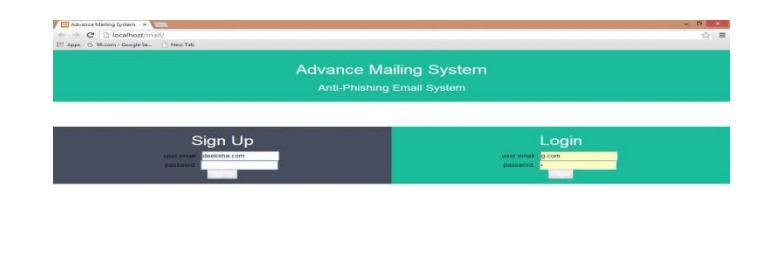
Figure 5. Login and sign up page

An end-host based anti-phishing algorithm which we call LinkGaurd, based on the characteristics of the phishing hyperlink. Since LinkGaurd is characterbased, it can detect and prevent not only known phishing attacks but also unknown ones. We have implemented LinkGaurd in Windows XP, and our experiments indicate that LinkGaurd is light-weighted in that it consumes very little memory and CPU circles, and most importantly, it is very effective in detecting phishing attacks with minimal false negatives. Link Guard detects 195 attacks out of the 203 phishing archives provided by APWG without knowing any signatures of the attack.