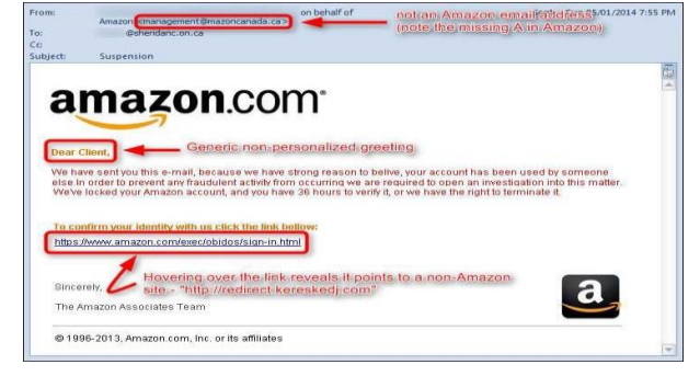
Figure 2. Spear Phishing