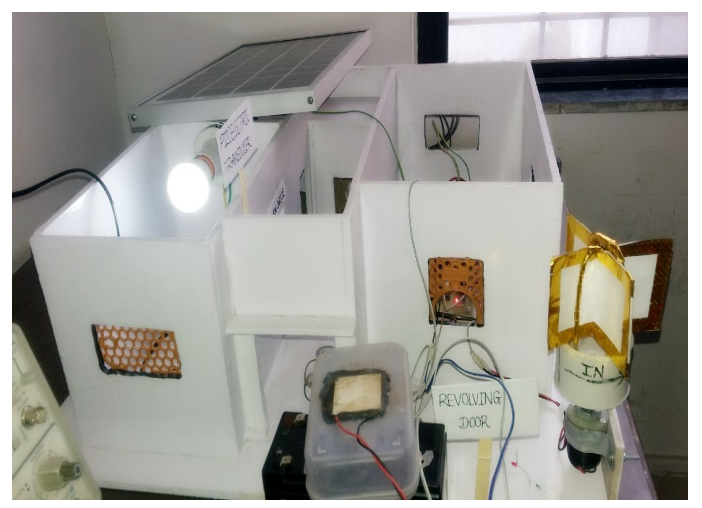
Figure 2. Circuitry of Project

Three different sections have been employing in this system. They can be divided like: