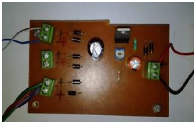
Figure 3. DC Grid System

The DC grid system has four DC input supply is given and this supply is regulated in voltage regulator IC LM317. When making output of the constant voltage for battery charging purpose. Diode is used to current flowing in unidirectional.