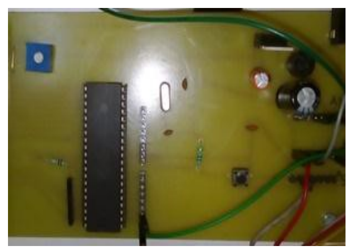
Figure 6. Microcontroller

The 18F452 PIC microcontroller is, as with all the other 18F series parts, optimized for using C.It has important features such as 256 bytes of EEPROM, Self programing ,an ICD,2 capture or compare or PWM functions ,8 channels of 10-bit analog to digital converter,the synchronous serial port can be configured as either 3-wire serial peripheral interface (SPI) ,etc.