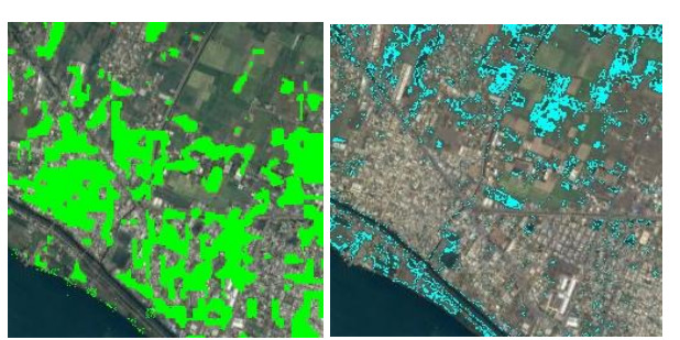
Figure 3: Trees in city

This result was a study of land cover classification using satellite image is man data source of mapping the regional image. The result to show the classification of and object base method and classification algorithm to achieve the total accuracy is 83.17% of result. Multispectral satellite image are detailed information of object sub class are non-forest trees, water, agriculture land, shadow images and NDVI values of base index of band ratios. In a NDVI band ratios are available in a different values are generated in index.