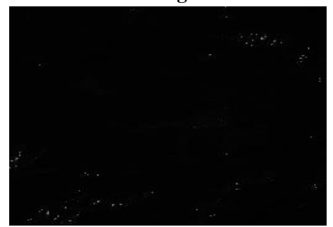
Figure 7: Water Region Index