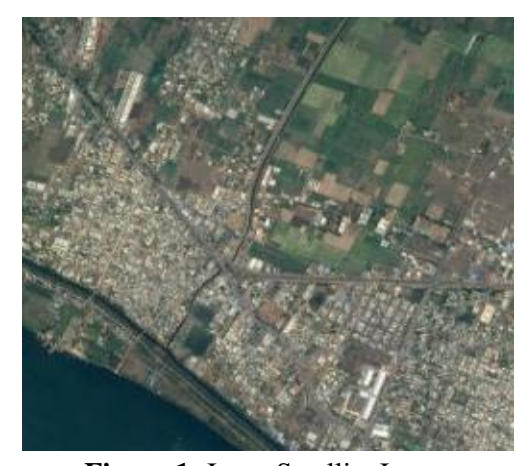
Figure 1: Input Satellite Image

Satellite images is a multispectral image are used to more information are provide the study area can extraction of land data. When a RGB band image are used in a spectral resolution with respectively. The satellite image size is 0\times255 resolution image.