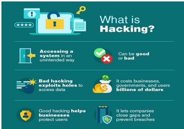
Fig 2: Concept of Hacking