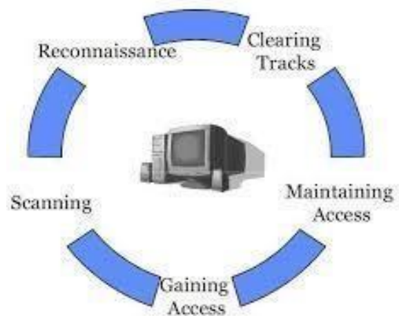
Fig. 3: Methodology of Ethical Hacking

Ethical hacking procedure has basically five different stages. Any ethical hacker has to follow these steps one by one to successfully reach its goal. The figure below demonstrates the five different stages of ethical hacking which are being followed by an ethical hacker while hacking a computer system or computer network [3][7][10][15].