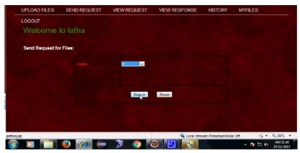
User can send request files to admin those files are seen shown below