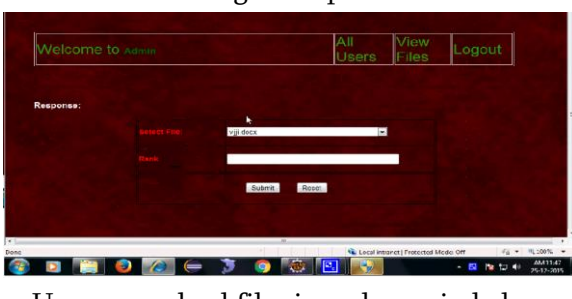
Admin can give response to user