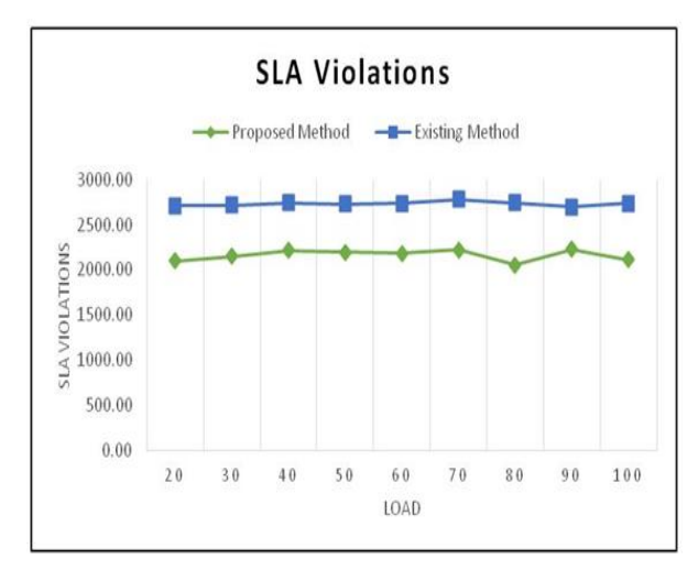
Figure 3. SLA Violation comparison between Proposed and Existing method