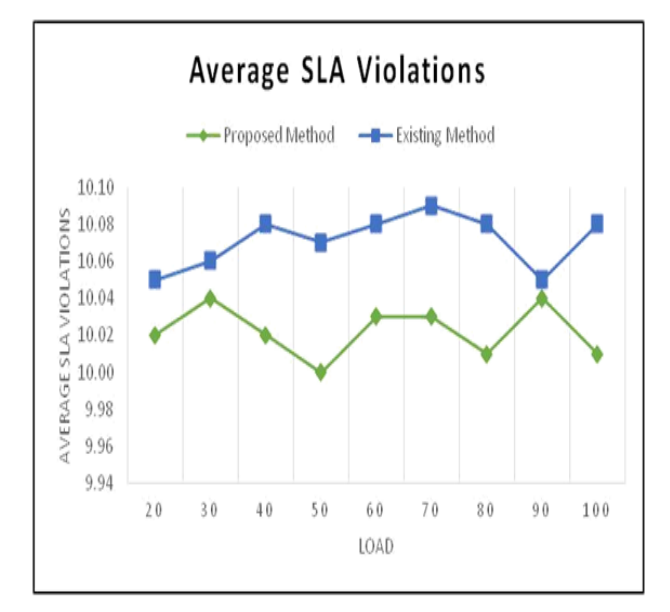
Figure 4. Average SLA Violation comparisons between Proposed and Existing method

Number of SLA violation is compared for proposed method and existing method figure 3. From graph we have analyzed that proposed method; incurs less number of SLA violations than the existing method. Average SLA violation is compared for proposed method and existing method in figure 4. From graph we have analyzed that proposed method; incurs less Average SLA violations than the existing method.