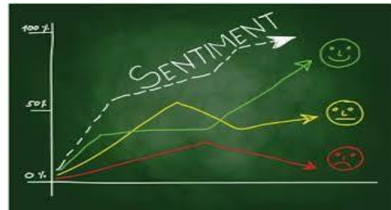
Figure 1c. Sentimental Analysis

(i.e., “I love the new Iphone;” and few lines later “But sometimes it doesn’t work well where the person is still thinking about the Iphone”).