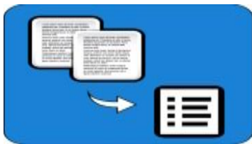
Figure 1c. Automatic Summarization

Information over loaded is a real problem when we need to access a specific important piece of information from huge known base. Automatic summarizing the meaning of document and information but also for understanding the emotional meaning inside the information such as collecting the data from social media.