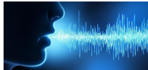
Figure 1d. Question Answering

As speech understanding technology and voice input applications improves, the need for NLP will only increase. Question answering is becoming more and more popular. Thanks to applications such as Siri, Ok Google and Virtual Assistance. A Question answering application is a system applicable of answering human request.