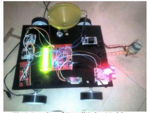
Fig 5: Snapshot of Overall Robot Model

and right bearing to drop the seeds at a specific position. Four wheels are associated at the base for the adaptable development of robot. Two DC engines are utilized to drive the wheels associated with the robot. L293D is utilized to drive the DC engines. Hindrance locator sensor is utilized to identify diverse obstruction in the way of the robot. In the event that any obstruction is distinguished in the way of the robot the data of the snag is sent to the client through remote association. In Seeding engines are utilized to drop a seed one by one. Grass cutting is finished by engines. Transfer is an exchanging operation and Furrowing is performed.