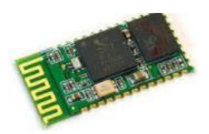
Figure 2. Bluetooth Module.

Bluetooth module HC-05 Bluetooth is a serial port convention module. It is a simple to utilize "Bluetooth" and intended for straightforward remote serial association setup.HC05 Bluetooth module was associated with the same microcontroller to set up a duplex correspondence channel amongst itself and the android advanced Mobile Phones.