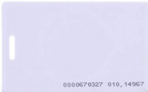
Fig 4. RFID card