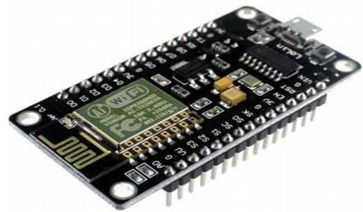
Fig 2. Wi-Fi model