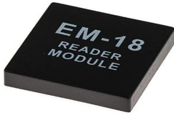
Fig 3. EM-18 Reader