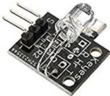
Fig 5. Heartbeat Sensor