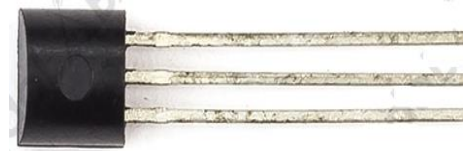
Fig 6. Temperature Sensor

The LM35 series are precision integrated-circuit temperature sensors, whose output voltage is linearly proportional to the Celsius (Centigrade) temperature. Since it has Linear + 10.0 mV/°C scale factor it is very easy to calculate temperature value.