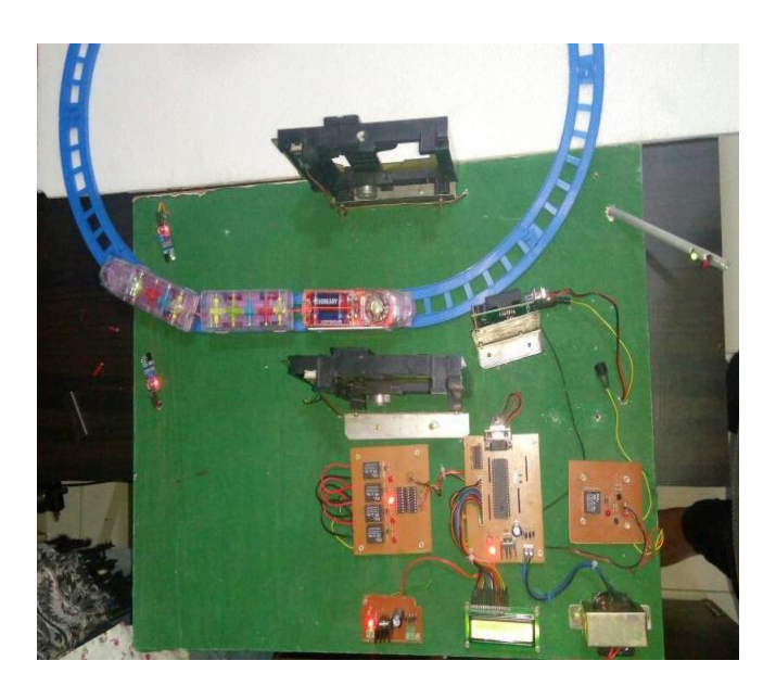
Figure 2. Proposed model of system