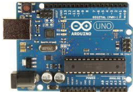
Fig 1. Arduino Board

The Arduino integrated development environment is a cross-platform application that is written in the programming language Java. It is used to write and upload programs to Arduino board. The source code for the IDE is released under the GNU General Public License, version 2.