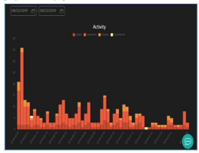
Fig1: Graph: Know about post & audience

Using sociograph.io/dashboard/page for showing information about pages and groups such as https://sociograph.io/page/13282617973249 78 select page and display related data. Fig 1 has shown about graph related page's information